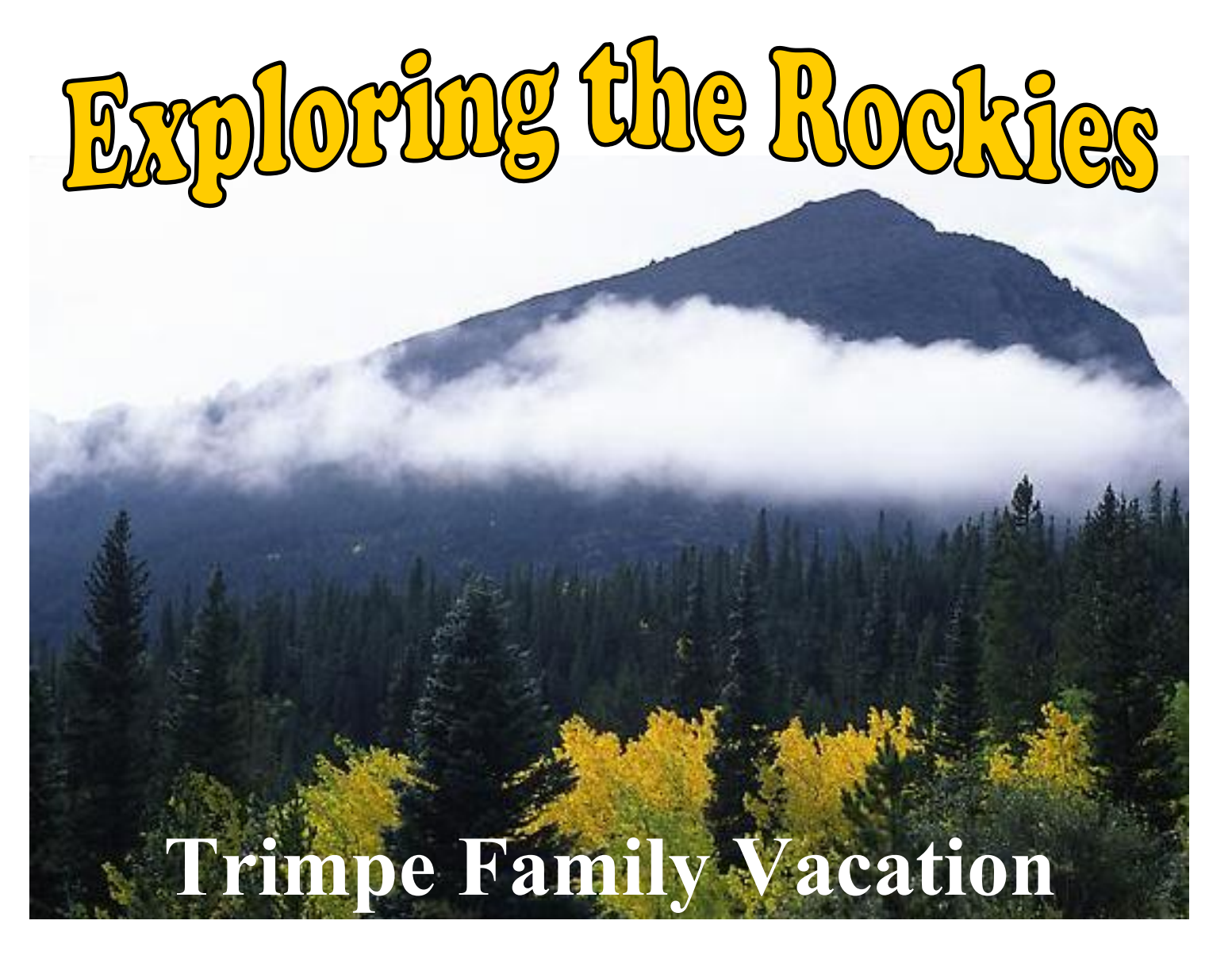
Road Trip USA Project