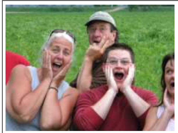
It was an exciting field trip on June 1 when EAS traveled to the Emiquon Preserve to explore Bluebirds & Botany — see back page.