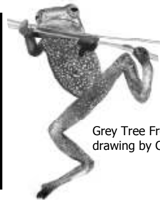
Grey Tree Frog drawing by Cindy McGrew