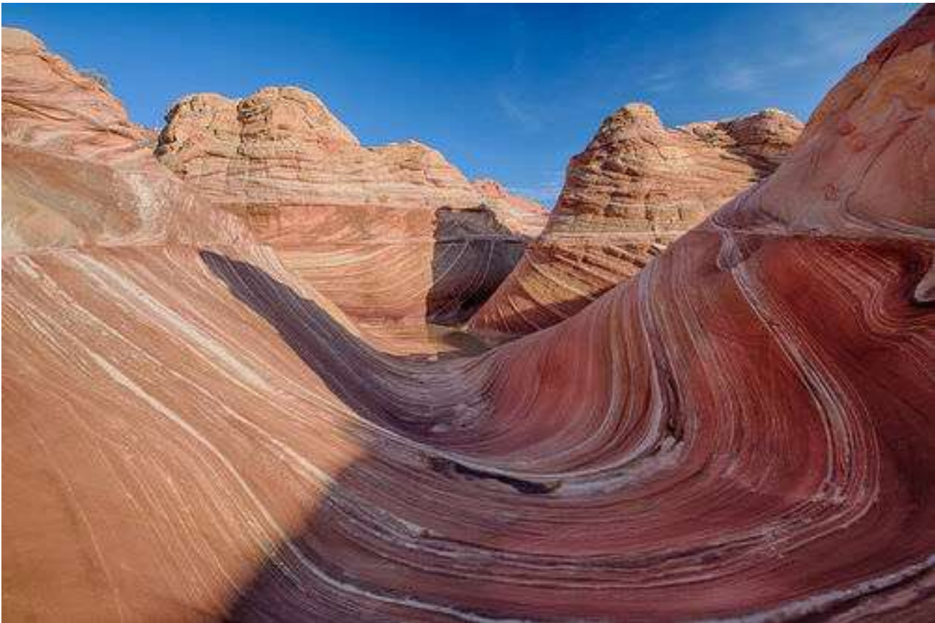
Developed for use with the Rock Detectives project at http://sciencespot.net/